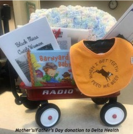
Mother's/Father's Day donation to Delta Health

An annual event, though the receptacle changes