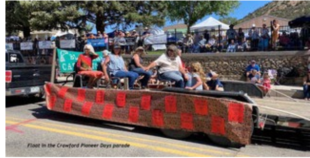
Float in the Crawford Pioneer Days parade

We donate our Vintage Cookbook to the Abraham Connection, a homeless shelter in Delta County as a fund raiser. Aside from attending the quarterly Western Colorado CattleWomen Council meeting in Redvale on August 9, we're now taking a break until our monthly meeting in September.